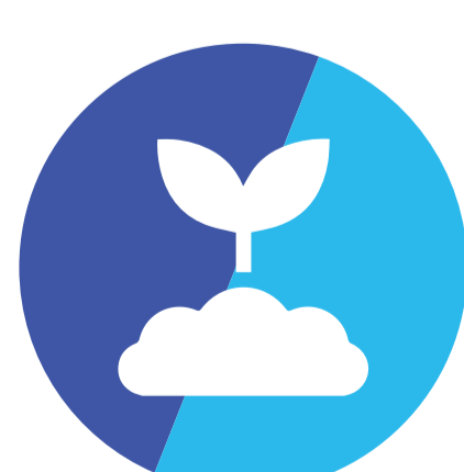
Designing with site avoidance in mind

Potential measures to mitigate EWA impact on cultural and natural resources could include: