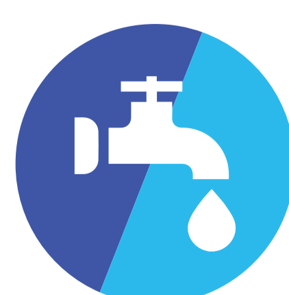
Creation of hydrological components