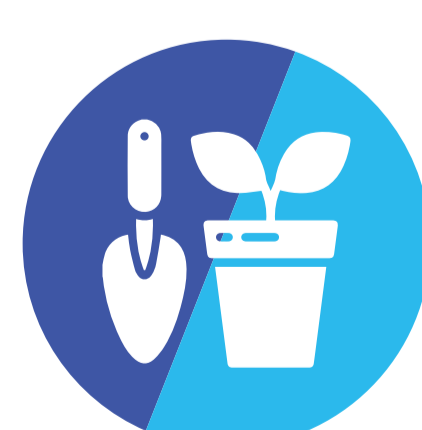
Landscaping and land contouring