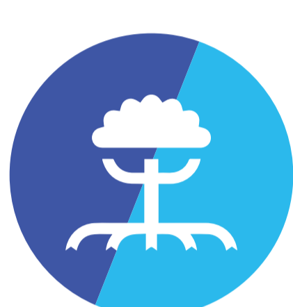
Central Mangrove Wetland

Specific cultural and natural heritage resources to be assessed within the EIA: